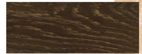
3092 Gold on Oak