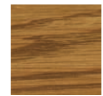
3072 Amber on Oak