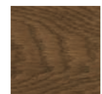
3075 Black on Oak

Note: The above colour shades are a true likeness of the original, however some variation may occur due to catalogue printing processes. It is advisable to test colours on a small sample, as some colours may appear different on other wood species.