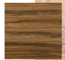
3073 Terra on Oak