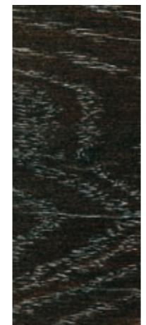
3091 Silver on Oak