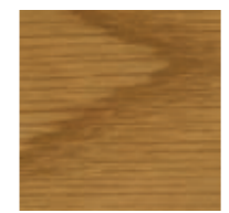
3071 Honey on Oak